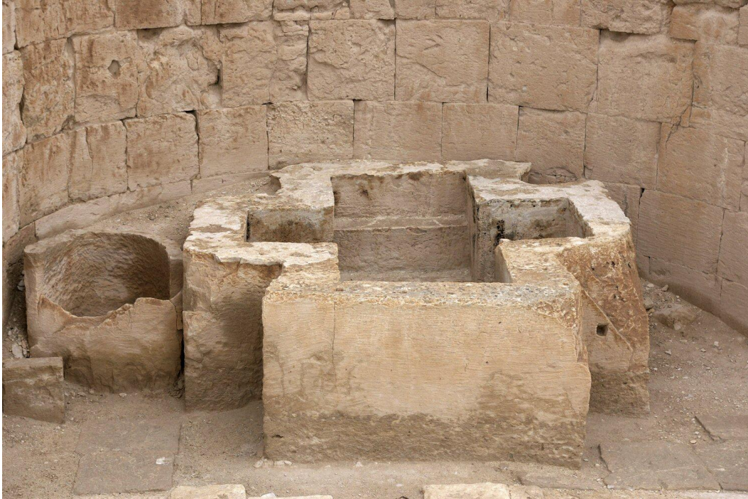
5th century baptismal font, Eitan GNU free documentation license.